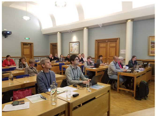
Meeting in Dublin Castle

There have been changes in the Chairs and co-Chairs of several Commodity Expert Groups. An updated list will soon be placed on the minor uses website.