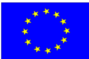
The MUCF is co-funded by the European Union

Although the funding for 2018 has been guaranteed, the funding for 2019 and beyond is still unsecure. But we are hopeful that we will also receive sufficient funding for the years to come to ensure the continuity of the MUCF.